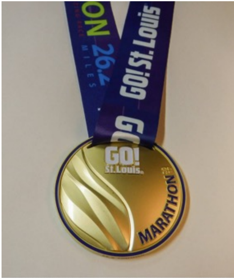
GO! St. Louis has always had beautiful finishers' medals.